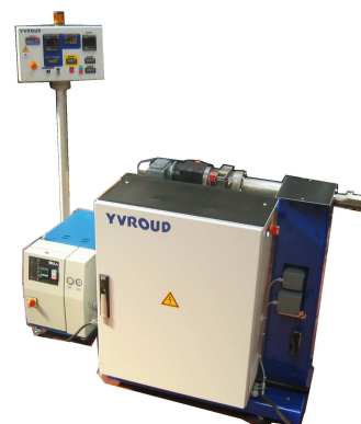
Silicone Extruders diameters 25 & 30 mm