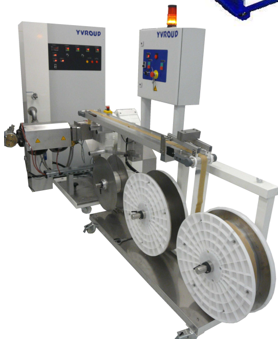
Pharmaceutical Strip Extruder diameter 40 mm